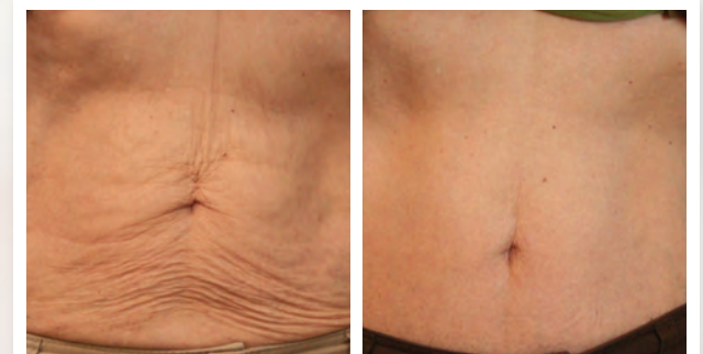
3 months post 4 treatments | courtesy of Meredith L. Harris, NP

SkinTyte is a non-invasive comfortable treatment using gentle infrared light to penetrate deep into the dermis in order to combat visible signs of aging.