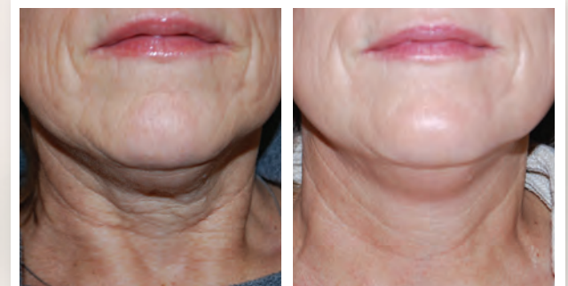
8 months post 6 treatments | courtesy of Kevin Robertson, MD