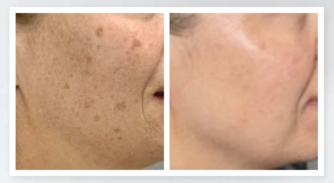
1 month post 2 treatments