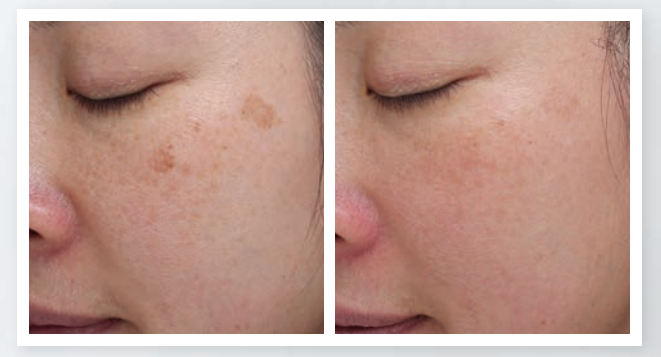
2 months post 5 treatments