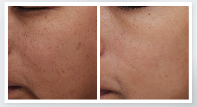
2 months post 3 treatments